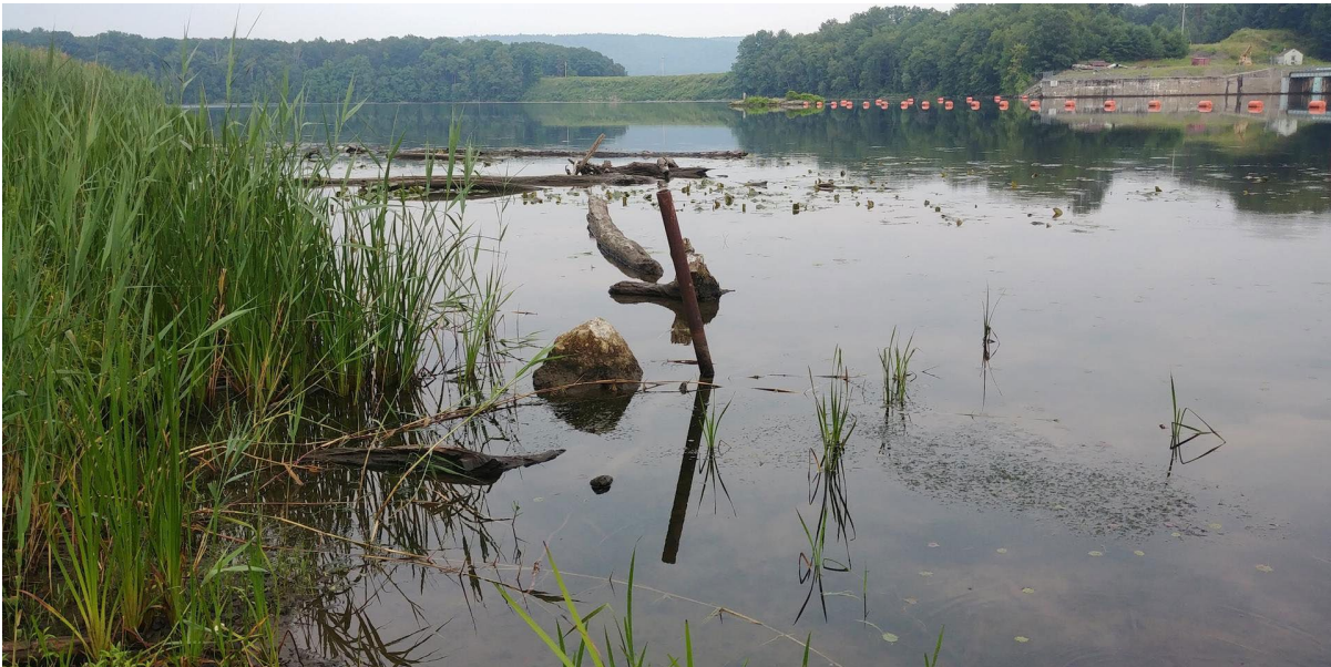
Portage takeout at Vernon Dam